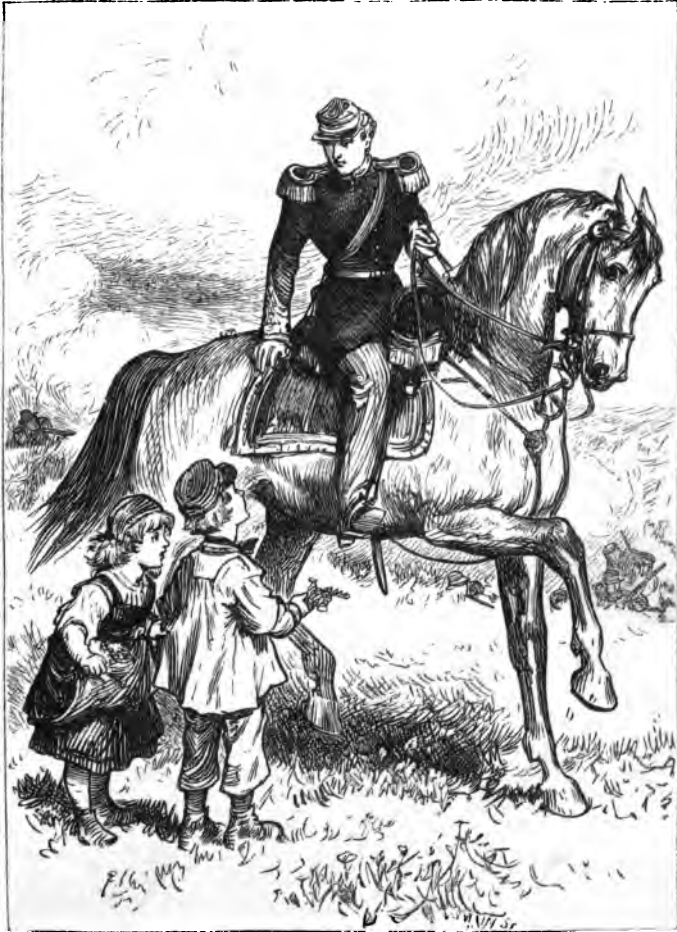
The Children on the Battle-field.—Page 191.